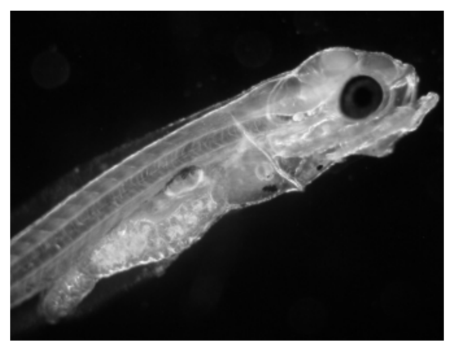
Figure 1. Eight-day-old sunshine bass fry with gut filled with rotifers.

There are many things that can go wrong in ponds during the culture of hybrid striped bass fingerlings, including sudden pH changes, excessive ammonia, rapid weather changes, and predation by large zooplankton or insects. Culturing fish in many small ponds rather than in a few large ponds helps ensure that a sufficient number of fingerlings get to market.